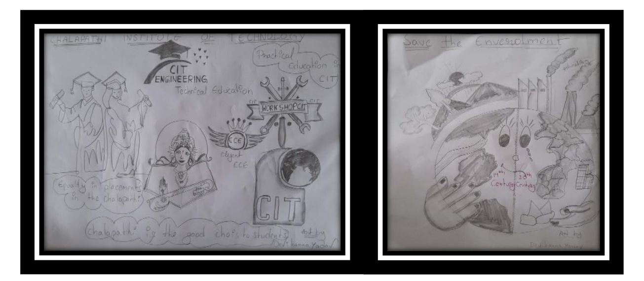
Art by G.Vyshnavi II ECE